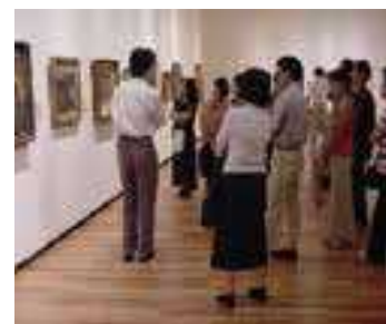
Fuchu Art Museum